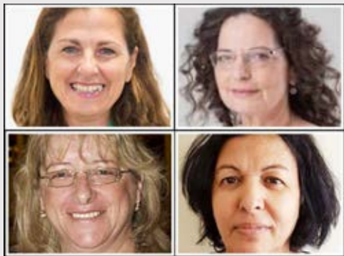
1 st Israel