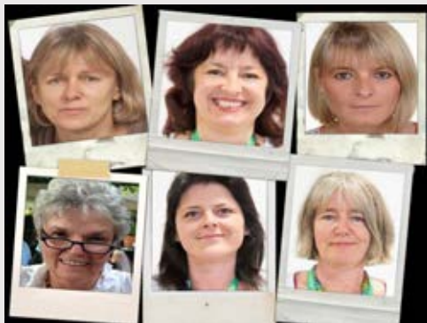
1 st Germany