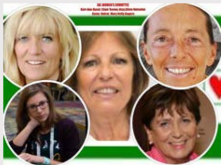
EBL Women's Committee 2018-2022