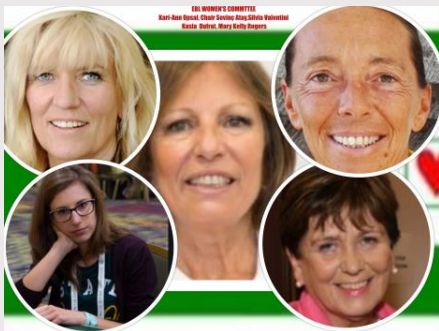
EBL Women's Committee 2018-2022