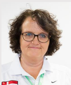
Lone Bilde Denmark