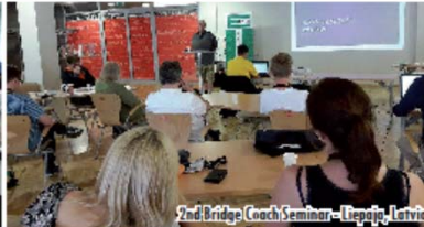
2nd Bridge Coach Seminar - Opatija, Croatia