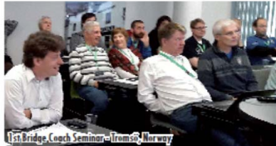
1st Bridge Coach Seminar - Tromsø, Norway