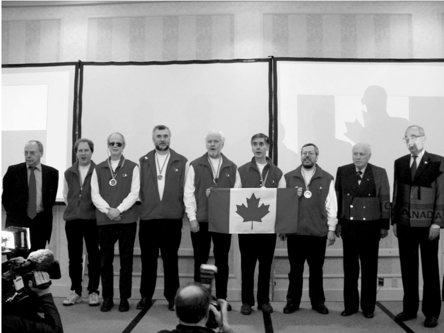
Seminar - Rome 2016