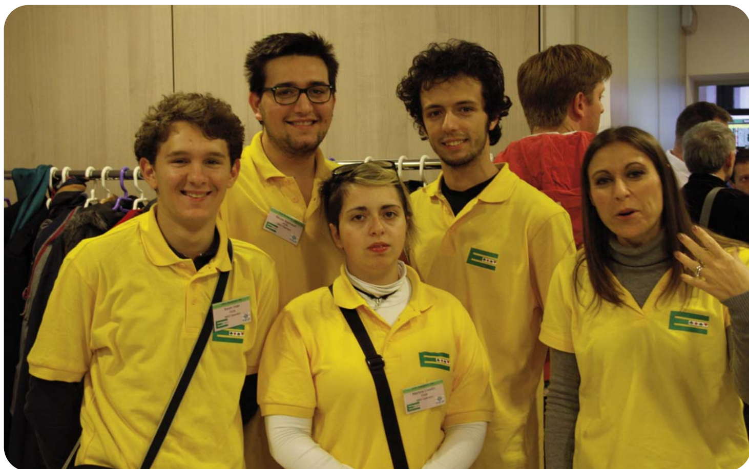
Our fantastic group of BBO operators

At the end of the Round Robin, the top two teams are still the same as last night: GS Allegra and Bamberger Reiter. These two teams already were certain to qualify for the Semifinals A before the last round started, so in their respective final matches they only played for the right to choose an opponent. As we all know, this right is not always an advantage but it was duly won by the holders, who thus succeeded in winning the round robin after being